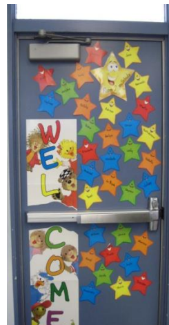
Here is a picture of my classroom door with stars for all of the 45 children.