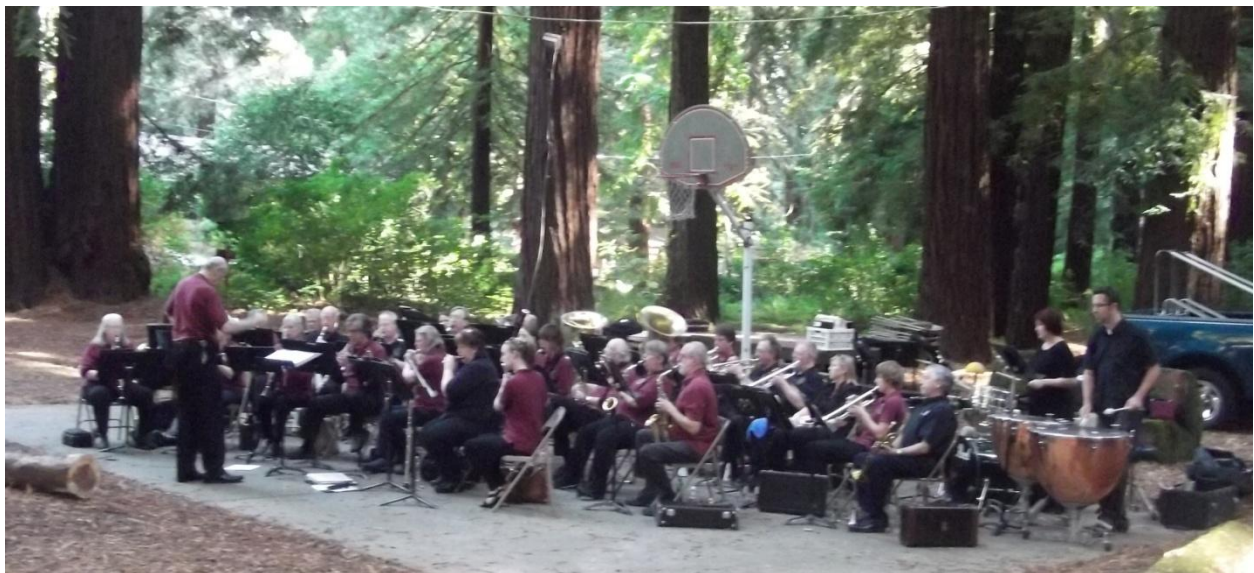
San Lorenzo Valley Band performs in the Picnic Grounds