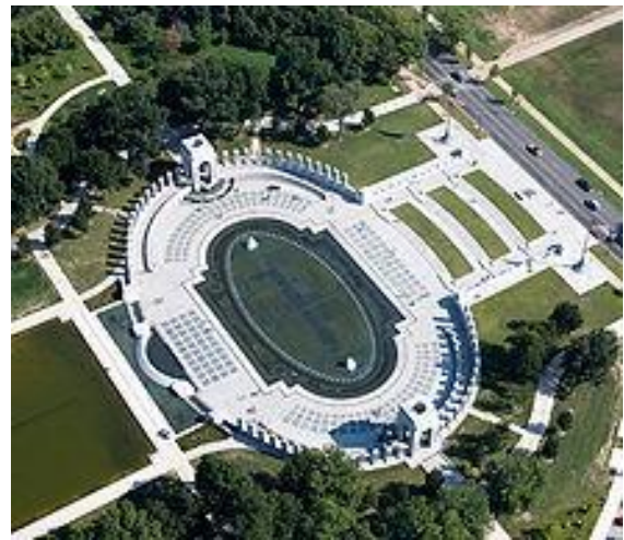
Aerial view of the National World War II Memorial